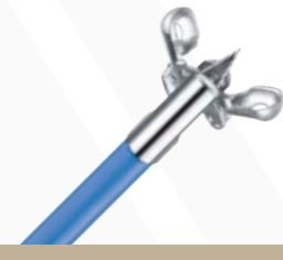
Disposable Biopsy Forceps 【Oval Cups With Needle Coated】