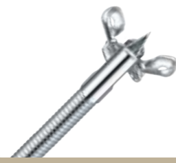
Disposable Biopsy Forceps 【Oval Cups With Needle】