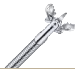
Disposable Biopsy Forceps 【Alligator Cups With Needle】