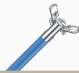
Disposable Biopsy Forceps 【Alligator Cups Coated】