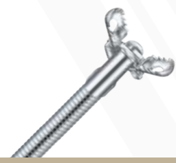
Disposable Biopsy Forceps 【Alligator Cups】