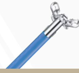
Disposable Biopsy Forceps 【Oval Cups Coated】